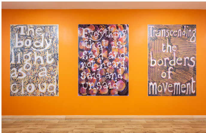
Jade Montserrat , Northside House, Forensic Unit