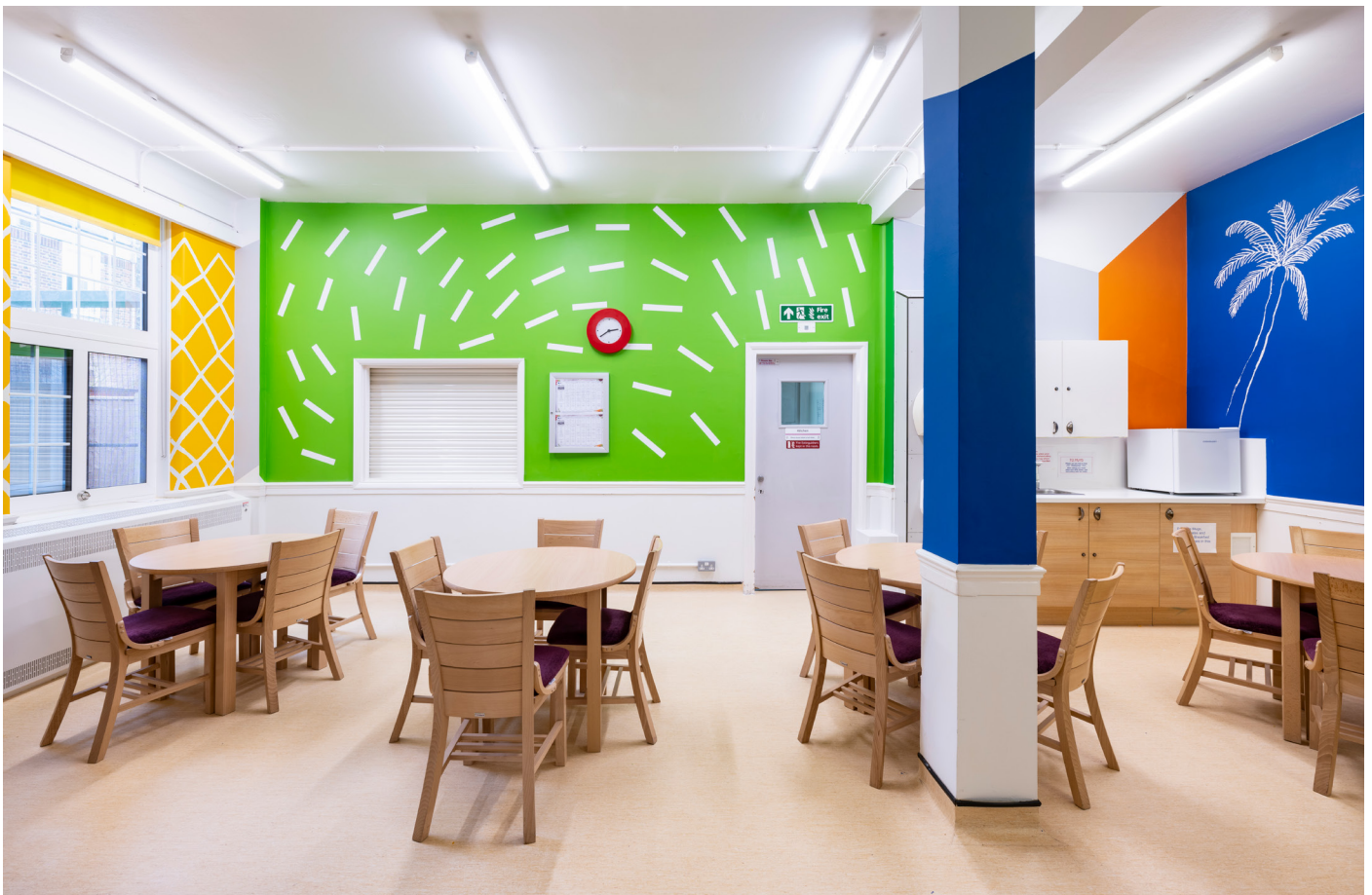
Naomi Frears Bethlem Mother and Baby Unit

“We are delighted to be working with Hospital Rooms to make art and creativity central to recovery. The importance of a therapeutic environment in supporting people with mental health needs cannot be overstated. We know that art can play a huge part in helping to create this environment and I have no doubt that this project will bring huge benefits for our staff and patients as we develop modern, improved facilities at Hellesdon Hospital.”