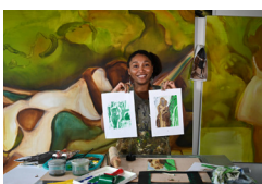
Sikelela Owen Digital Art School

Hospital Rooms and Hauser & Wirth intend on building new opportunities for the arts to form an integral part of mental health treatment and services in 2022.