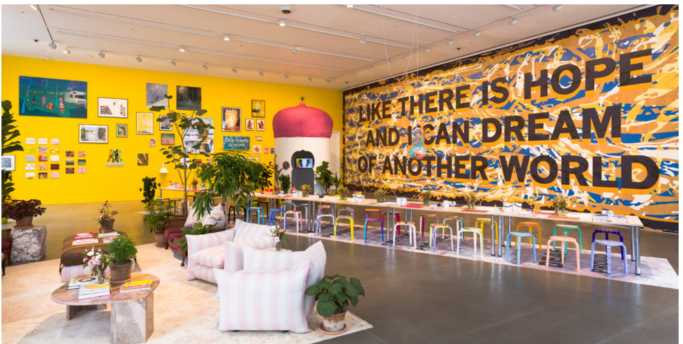
Installation view 2022 / 'Hospital Rooms - Like there is hope and I can dream of another world' Hauser & Wirth London / 2022

Hospital Rooms and Hauser & Wirth will continue their partnership over 3 years through a series of initiatives that continue to dramatically expand and deepen Hospital Rooms' impact.