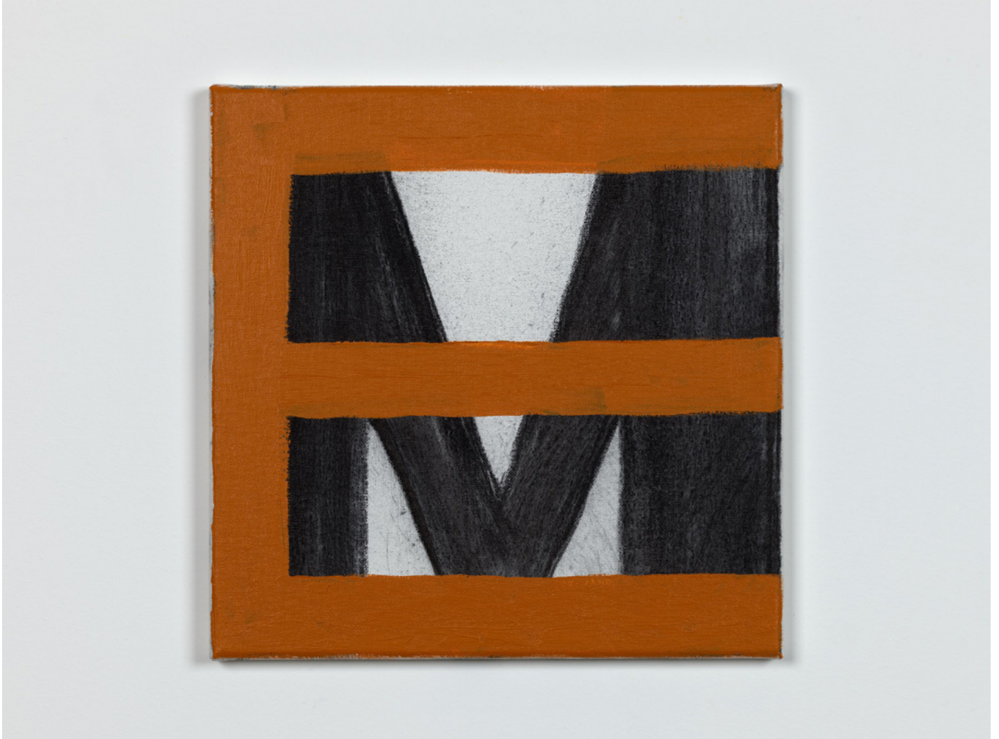
Martin Creed (b. 1968) / Work No. 3130 / ME / 2018 / Acrylic and charcoal on canvas / © Martin Creed / All Rights Reserved, DACS 2023

In the summer of 2023, Hospital Rooms and Hauser & Wirth will resume their 3 year collaboration which aims to raise £1million for the arts and mental health charity.